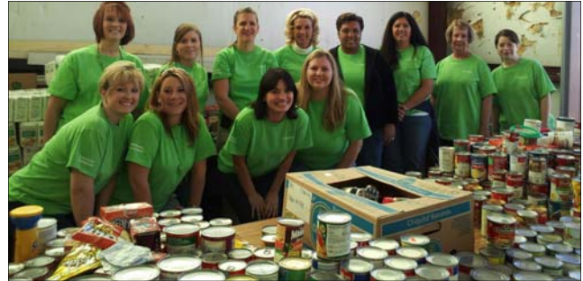
Inspire employees take time from their work day to volunteer at HAAM

various scout troops, national charity leagues, just to name a few. Calls and emails are continuous from individuals and groups wanting to help our community. These dedicated workers support our ministry every day of the year.