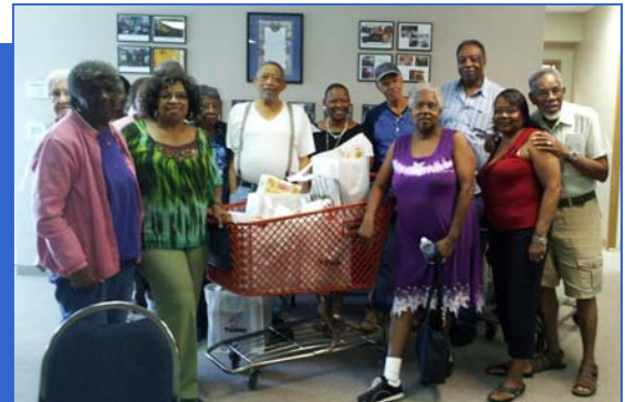
Bordersville Senior Group

In the plans for 2012, we hope to provide guest speakers, relating to our senior community members and a light lunch.